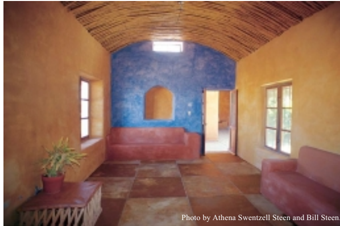
A glimpse of the interior of a finished home, from the popular book The Beauty of Straw Bale Homes by Athena and Bill Steen.