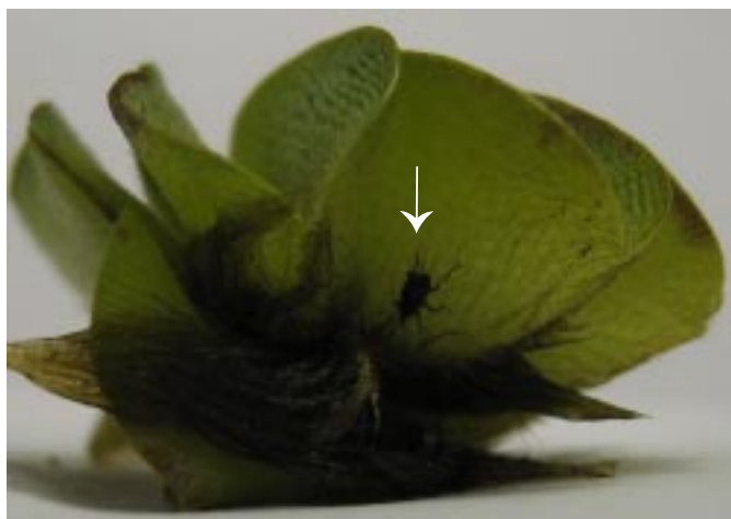
A piece of salvinia showing the weevil, Cyrtobagous salviniae , which feeds on the floating vegetation. The brown, root-like hairs, are actually heterosporous reproductive structures.

There are a number of ways the plants can be distributed to new regions. They can cling to boat motors or trailers, fishing rods, pets or even people. They have also been spread in the aquatic plant trade. Once they become established in a rice field they can be spread by tractors, combines or other equipment.