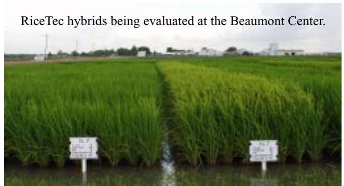
RiceTec hybrids being evaluated at the Beaumont Center.

In 1979, the International Rice Research Institute (IRRI) revived its hybrid rice program, and 6 years