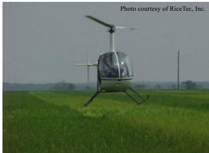
In producing hybrid seed, a helicopter is sometimes used to insure better pollination of the male sterile line.

Another two-line approach for hybrid rice seed production is by spraying chemical hybridizing agents (CHAs) that selectively sterilize the male reproductive organs of one parent. This technique was used for commercial production in China, but CHAs contain arsenic, which pose unacceptable health and environmental risks, so the practice was discontinued.