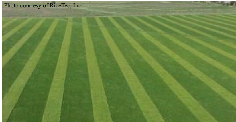
A production field for hybrid rice seed, clearly showing the two different parent lines. The hybrid seed is produced on the male sterile line only.

Research on male sterile rice was first initiated in China in 1964, although rice heterosis was not successfully exploited until after the discovery of the wild abortive male sterile cytoplasm in the wild species O. rufipogon Griff at Hainan Island in 1970. By 1973, China had the means to develop the three-line system of hybrid rice production, namely, a male sterile (A) line, a maintainer (B) line, and a restorer (R) line. (See fig. 1) The first rice hybrids were put into commercial