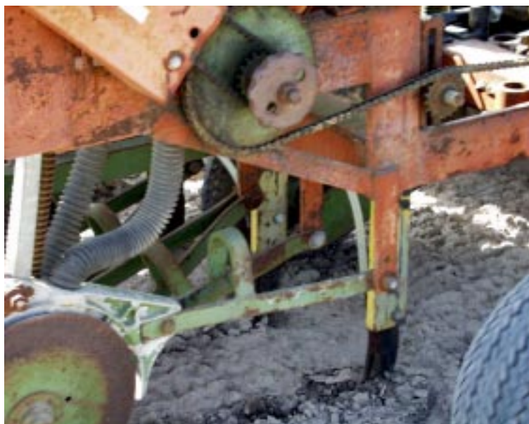
This photo illustrates how the fluid fertilizer is banded into the soil at the time of planting.

Fertilizer treatments were superimposed on flood irrigation treatments consisting of establishing the flood at the 4- or 6-leaf growth stage. Fertilizer treatments include: (1) 150 lbs N/A