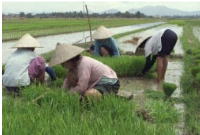
Researchers in China are actively pursuing the development of genetically engineered rice to meet the demands of their growing population.

Those in favor of GMO technology point out the many benefits it offers farmers and the general public. Farmers can save money on costly herbicides, pesticides and fertilizers, while the public can benefit from a consistent and affordable food supply. In addition, people in developing countries that face possible starvation as populations continue to rise, have a chance to use existing farmland to feed themselves in the challenging years that lie ahead. *