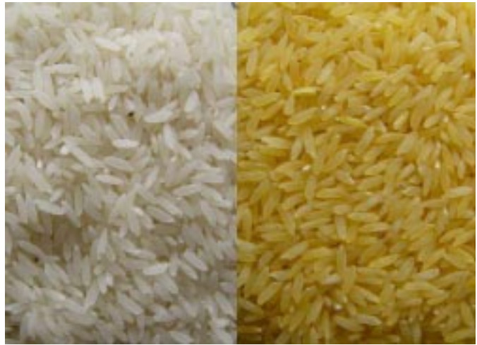
Golden Rice, pictured on the right, is a genetically engineered variety whose grains contain the yellow-orange pigment beta-carotene, a plant-based source of vitamin A.

The EU first began barring the sale of genetically modified crops and foods in 1998, mainly due to health concerns. It continued to do so up until 2004, when the European Commission allowed U.S. firms to begin shipping a modified strain of sweet corn into EU member countries. EU officials have allowed the import of nine biotech crops since 2004, but the American Soybean Association (ASA) believes the U.S. needs to continue to push the Europeans to base import decisions on scientifically sound principles. They believe this favorable WTO ruling should only be seen as a starting point in the actions against Europe’s unjustified and unscientific policies toward biotechnology, and what must follow is a challenge of the EU’s