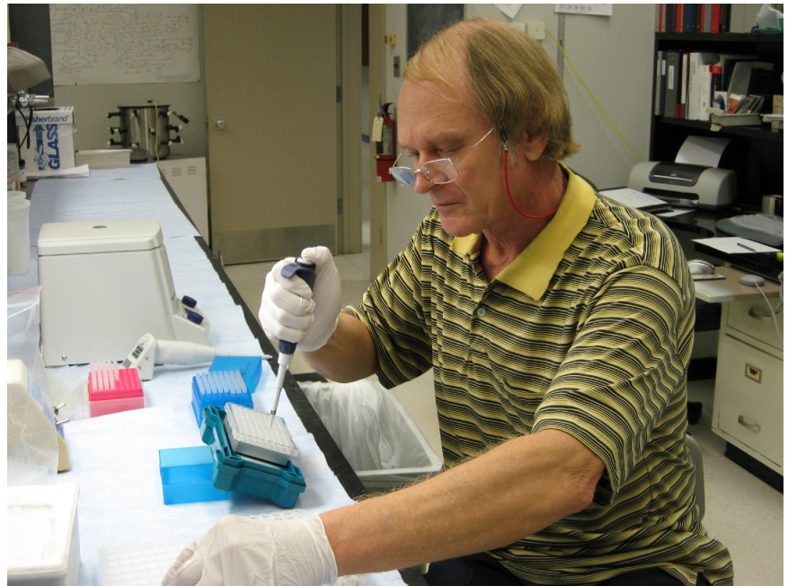
Fig. 1. Marker-assisted selection being conducted at Texas AgriLife Research and Extension Center at Beaumont, TX.