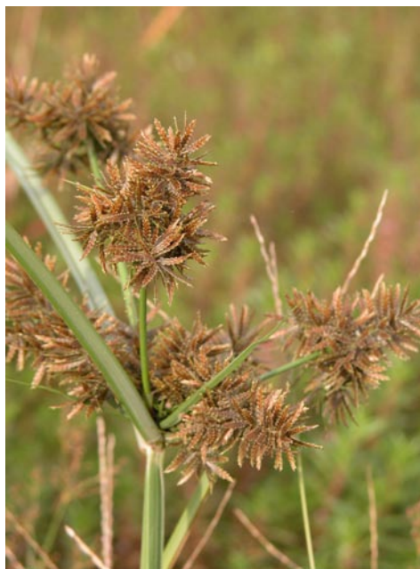
A biotype of sedge Cyperus difformis was found to be resistant to bensulfuron-methyl in California.

Over the past several years, there has been a dramatic increase in herbicide resistance in many weed species. For this reason, researchers around the world