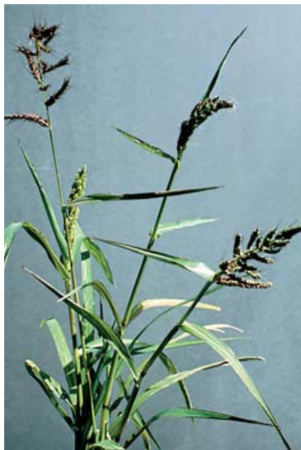
A biotype of barnyardgrass, Echinochloa crusgalli , was found to be resistant to the herbicide propanil in Texas.